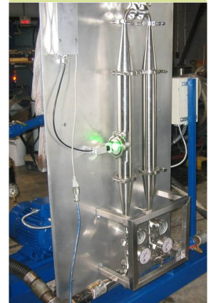
The Catalate Amplifier™ 100

Proof of Concept Pilots Available for Select Partners